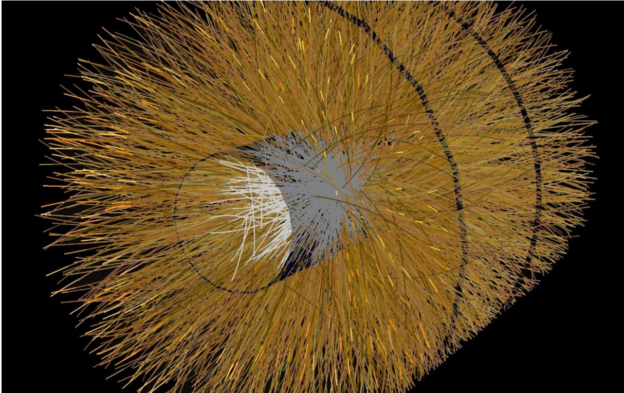
Pb+Pb © sqrt(s) = 2.76 ATeV