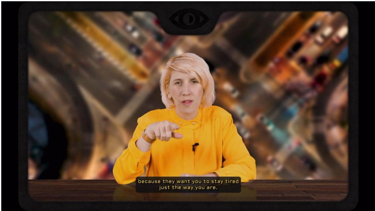
Ali Eslami, A Stretch of Time, 2022, video still, Immersive Days #3