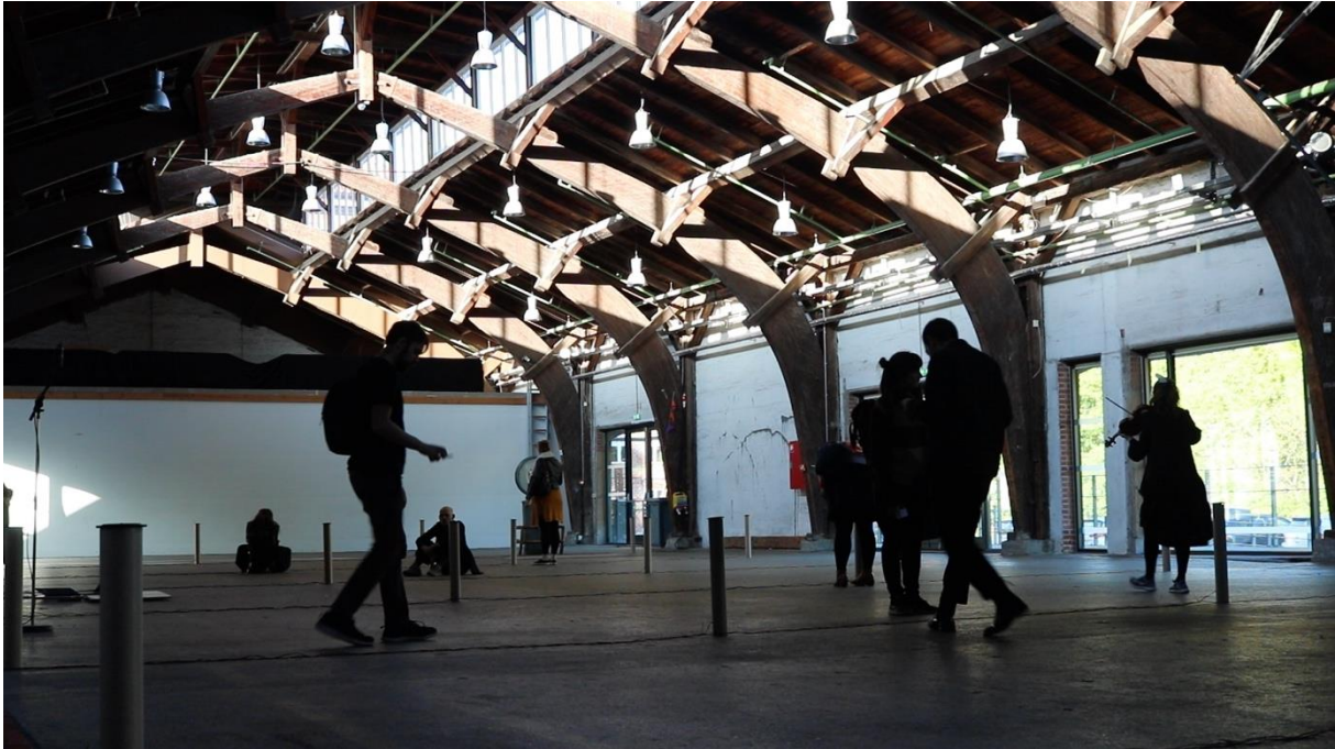
An Urban Archive as an English Garden, SPOR festival, 2019, Rå Hal, Aarhus © Halla Steinunn Stefánsdóttir